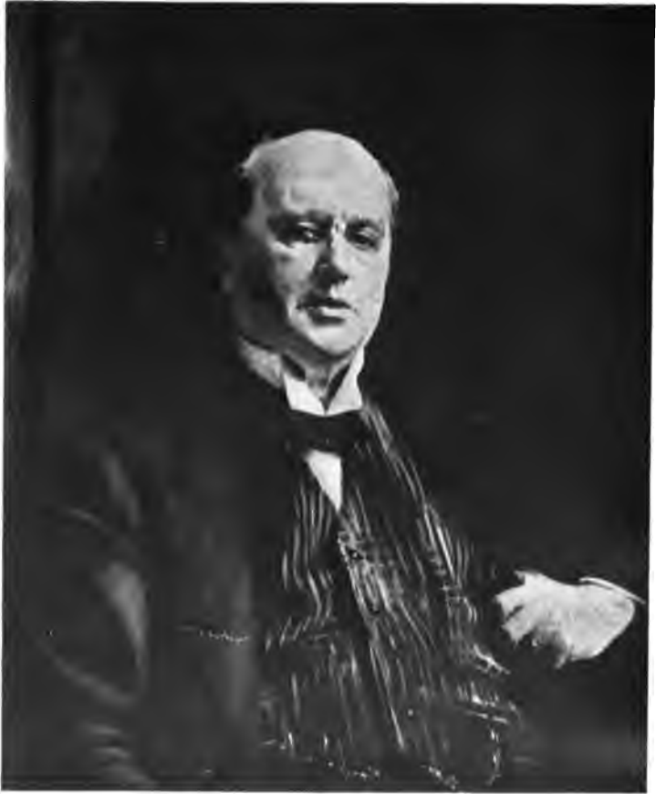
The Sargent Portrait of Henry James